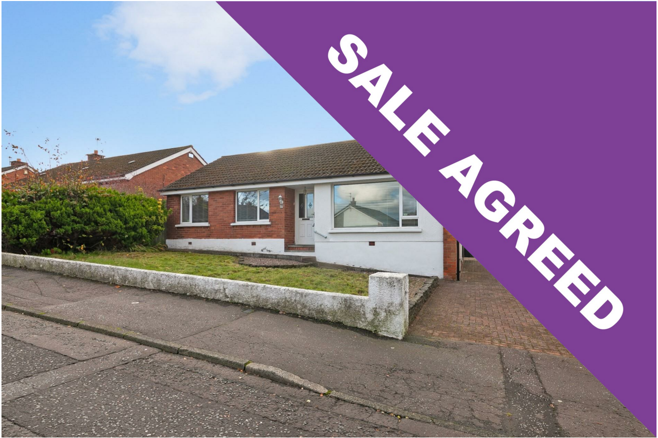
100 Carnvue Road, Newtownabbey, BT36 6RH